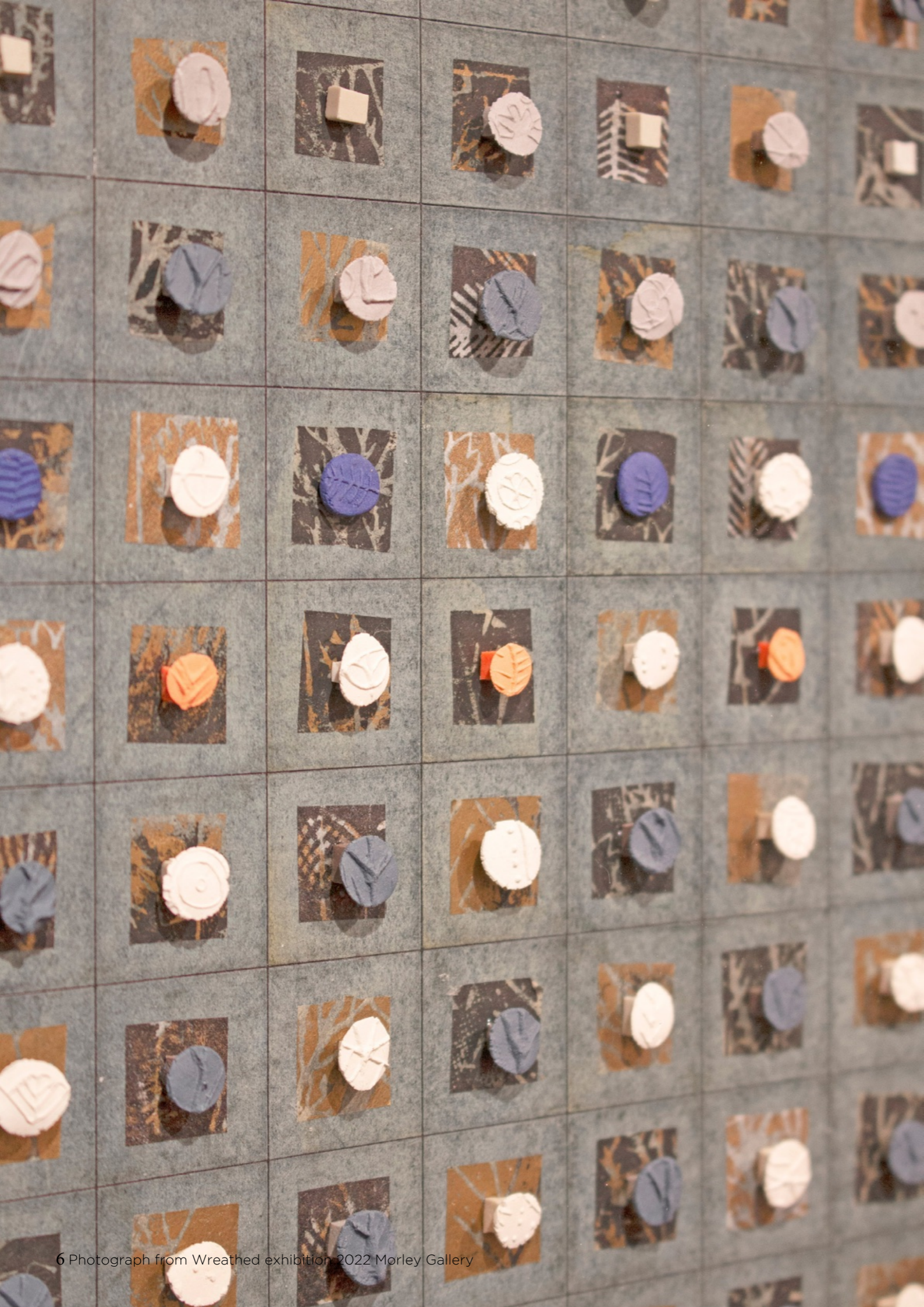
6 Photograph from Wreathed exhibition 2022 Morley Gallery