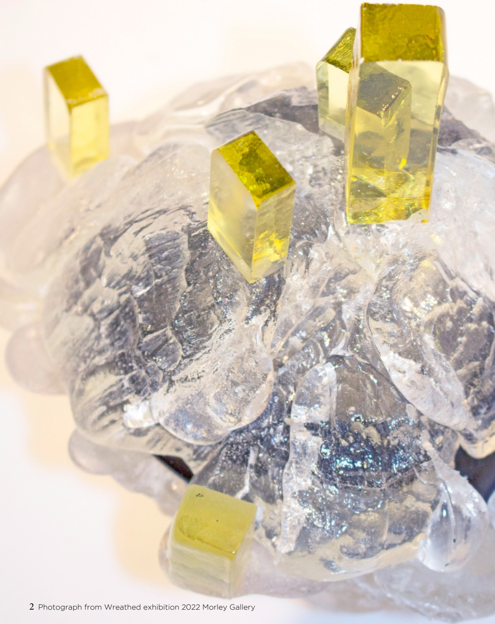
2 Photograph from Wreathed exhibition 2022 Morley Gallery